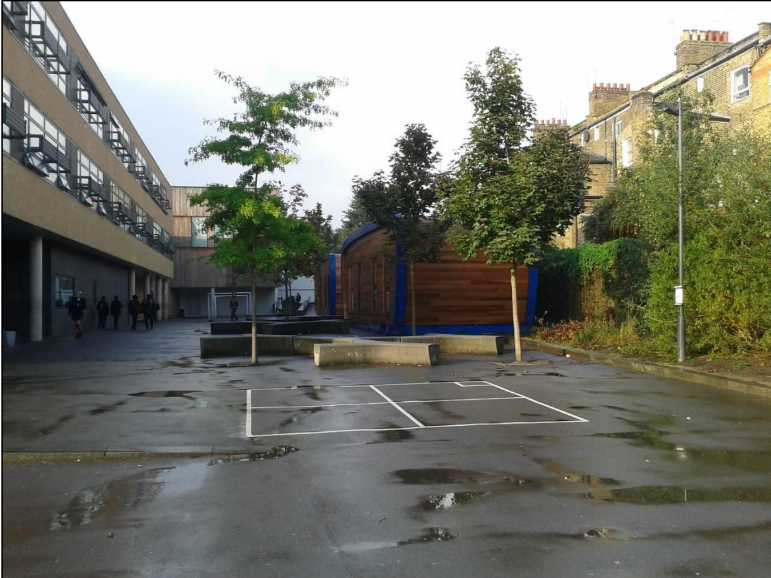
Photo 5: Existing pods constructed on Crossley Street boundary to illustrate construction and materials.