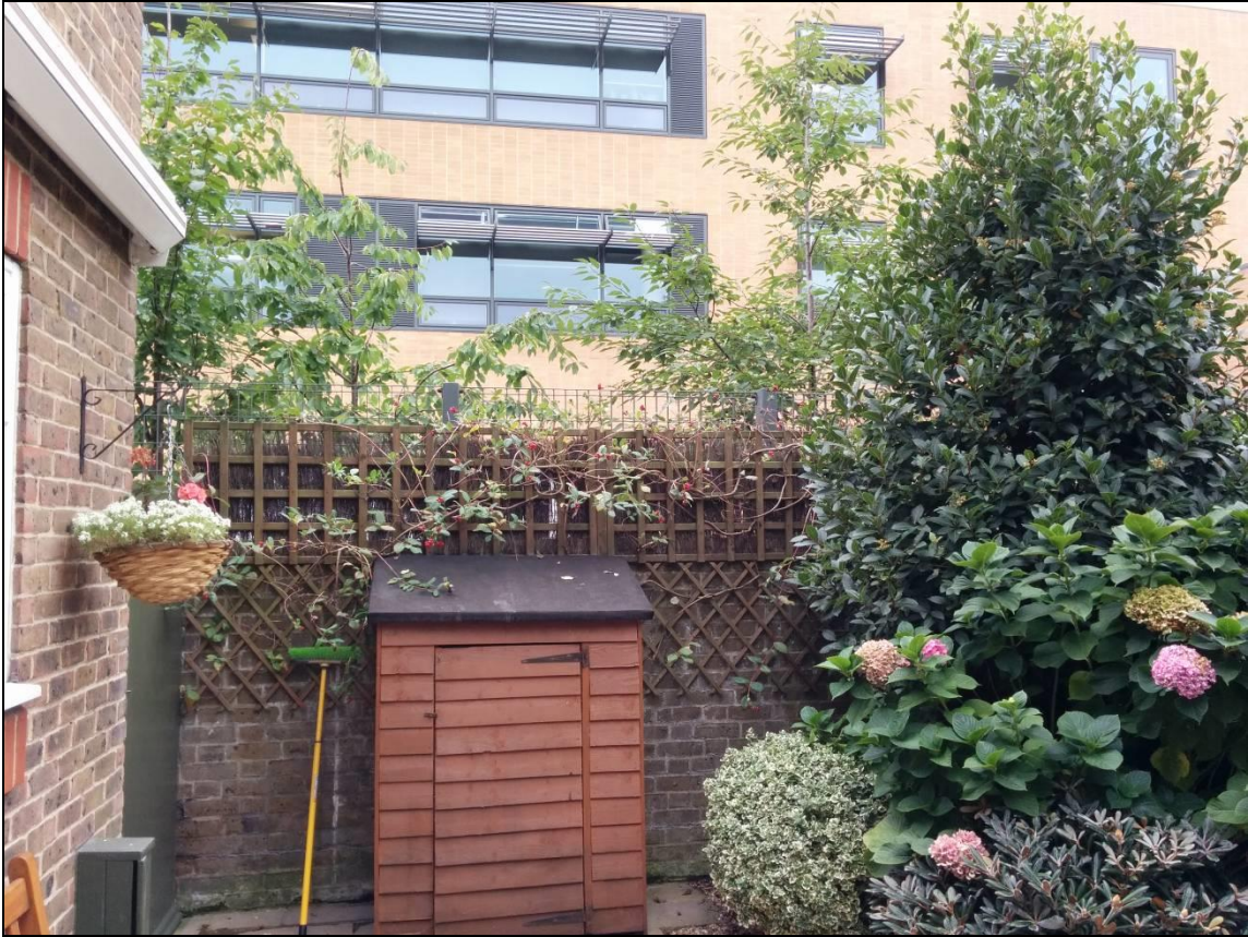
Photo 3: View towards proposed pod from 10 Bride Street rear garden