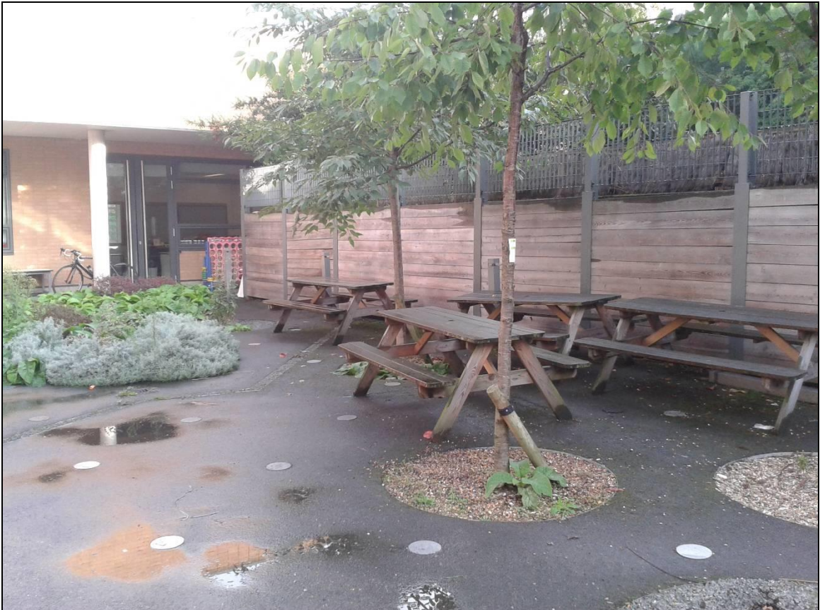
Photo 4: Interface and boundary treatment with 10 Bride Street from within subject site