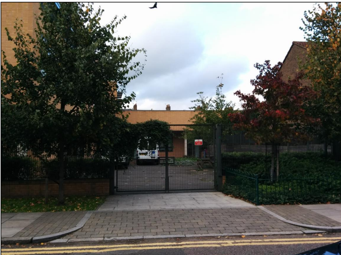
Photo 2: Location of proposed pod from Bride Street frontage